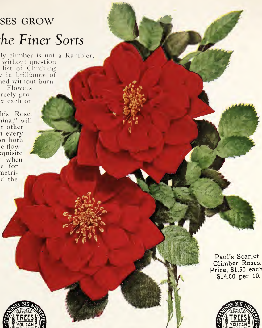
Paul's Scarlet Climber Roses. Price, $1.50 each, $14.00 per 10.

Doctor Van Fleet. One of the newer type of climbers. This variety shows a mass of beautiful clustered buds, which open out into large, shapely flowers; delicate flesh white. An admirable cutting variety with stems 12 to 18 inches long.